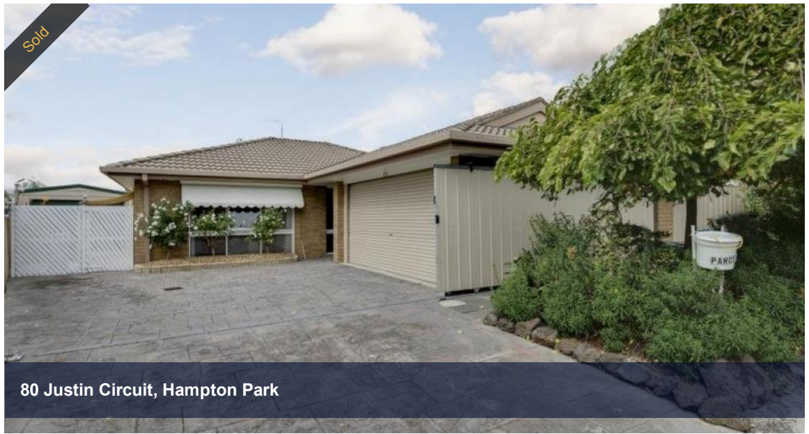
80 Justin Circuit, Hampton Park