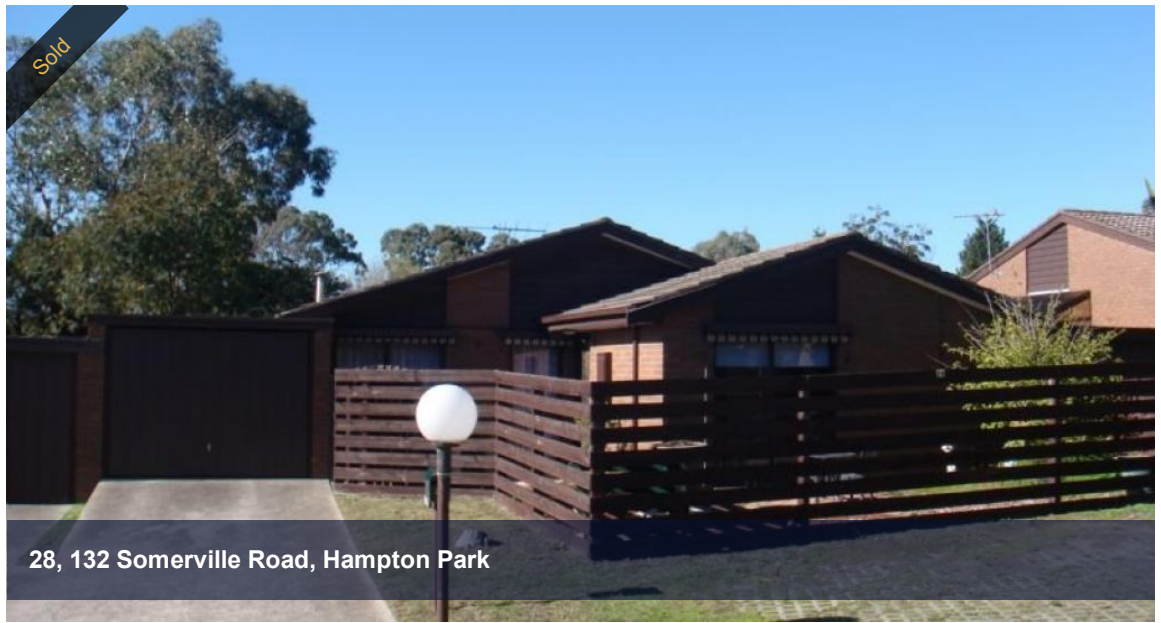
28, 132 Somerville Road, Hampton Park