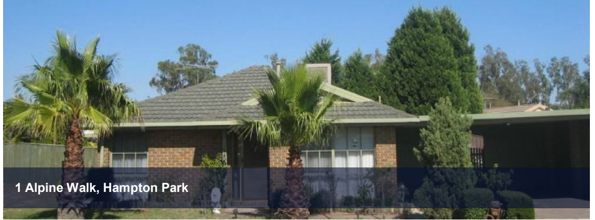
1 Alpine Walk, Hampton Park