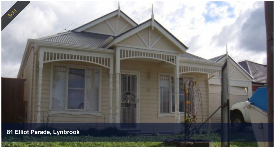
81 Elliot Parade, Lynbrook