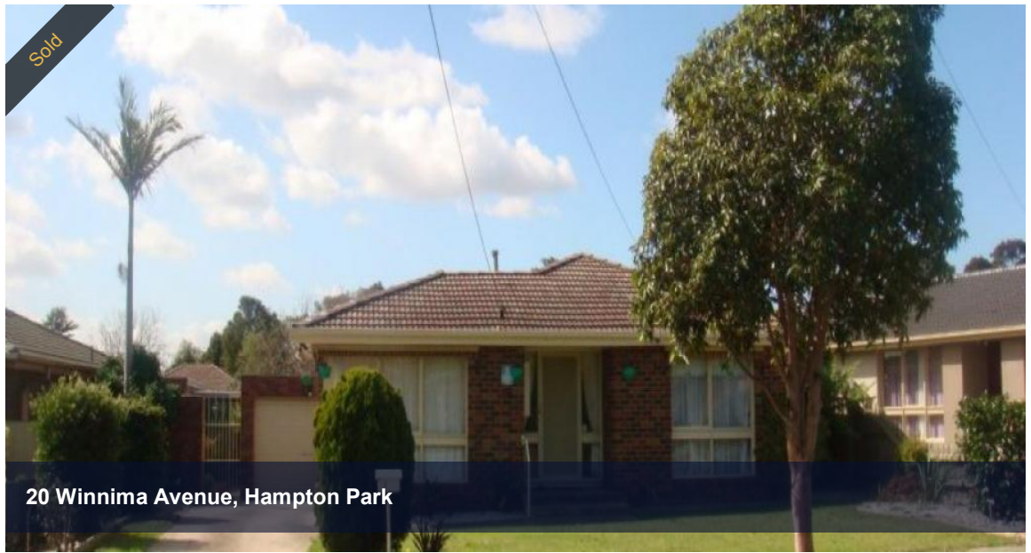
20 Winnima Avenue, Hampton Park