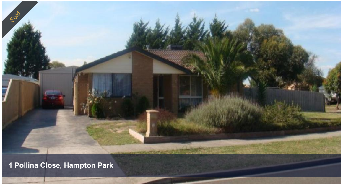
1 Pollina Close, Hampton Park