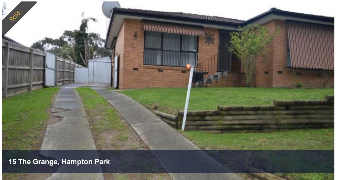
15 The Grange, Hampton Park