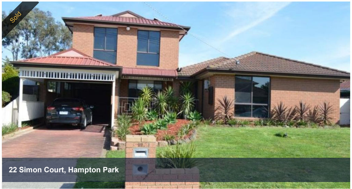
22 Simon Court, Hampton Park