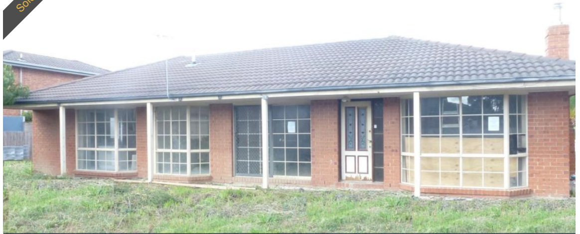
5 Ashton Rise, Narre Warren South