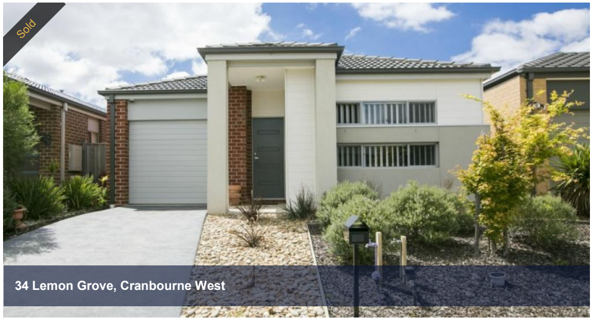
34 Lemon Grove, Cranbourne West